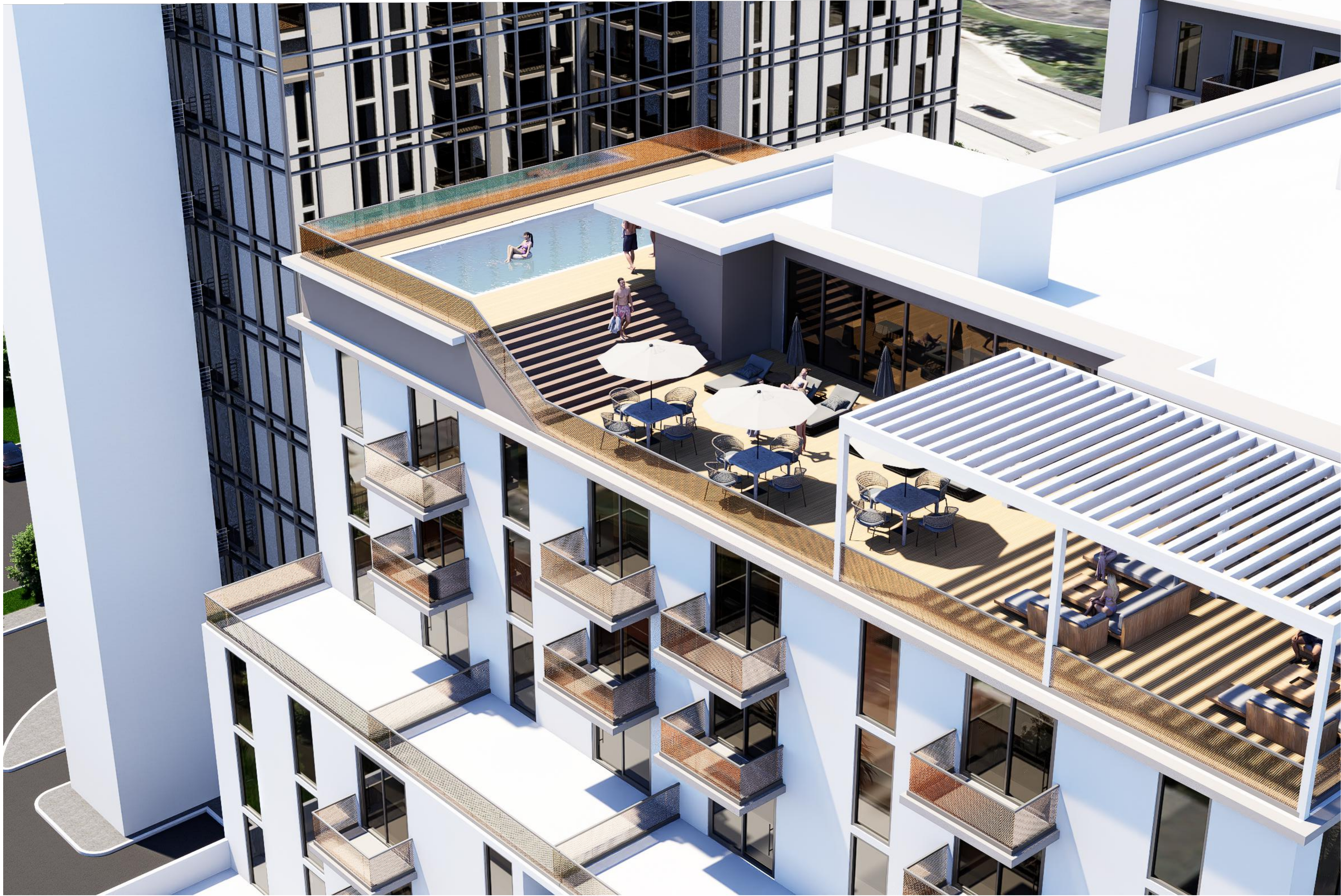
ZOOM-IN VIEW OF THE ROOFTOP POOL